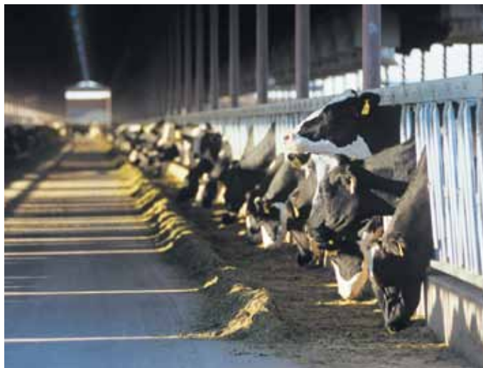
Unlike vechur cows (left), Holstein cattle (right) have little resistance to heat, humidity and tropical diseases, and are most productive in controlled environments.

of processed animal products consumed contributes to ill health, with higher rates of cancer and coronary heart disease. For the world's poor people, however, there are clear nutritional advantages to consuming small amounts of high-quality animal foods, which are rich in protein, essential amino acids, iron and various essential micronutrients that improve chances for normal physical and cognitive development 8 .