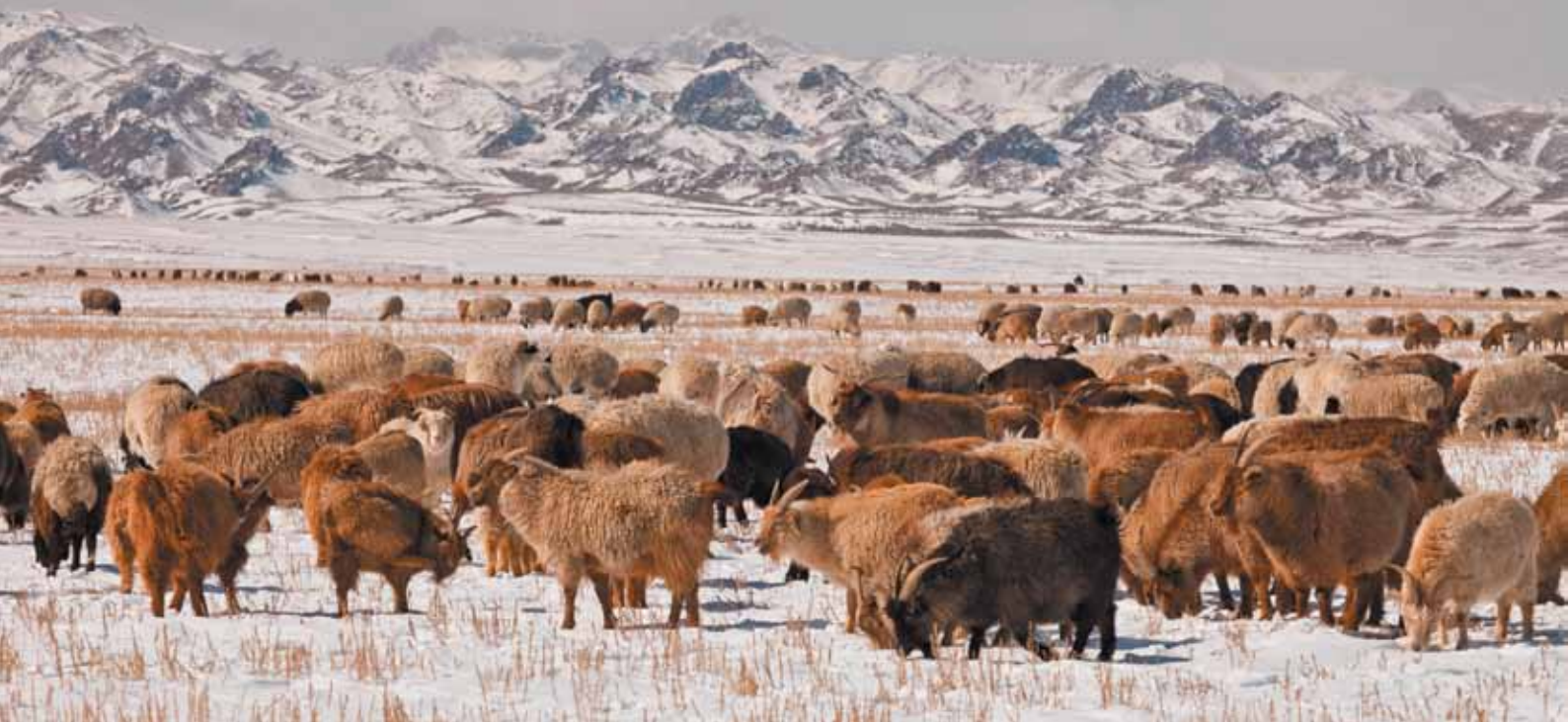
Domestic goats and sheep can graze marginal lands, such as the Gobi Desert in Mongolia.